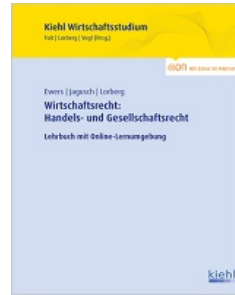
> Wirtschaftsrecht: Handels- und Gesellschaftsrecht