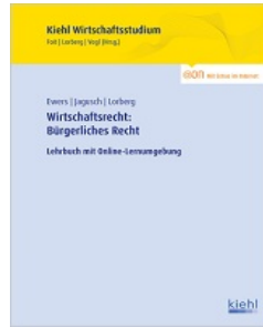
> Wirtschaftsrecht: Bürgerliches Recht